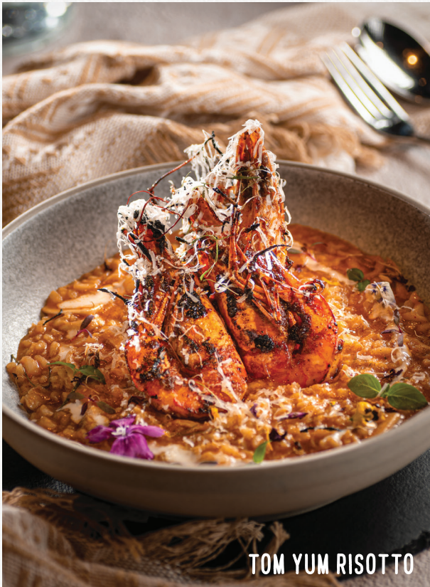
TOM YUM RISOTTO