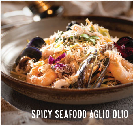
SPICY SEAFOOD AGLIO OLIO