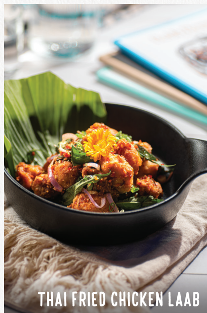
THAI FRIED CHICKEN LAAB