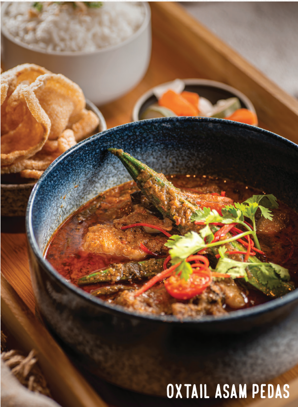
OXTAIL ASAM PEDAS