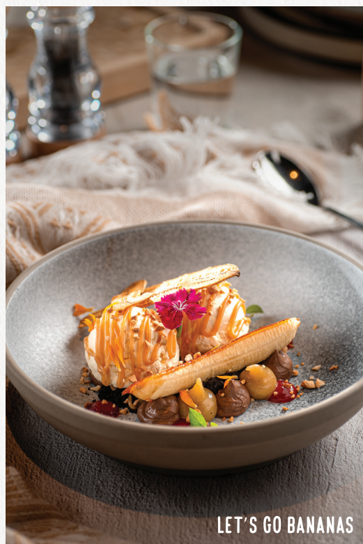
LET'S GO BANANAS