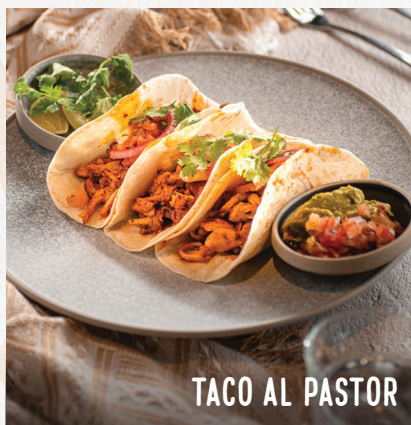
TACO AL PASTOR