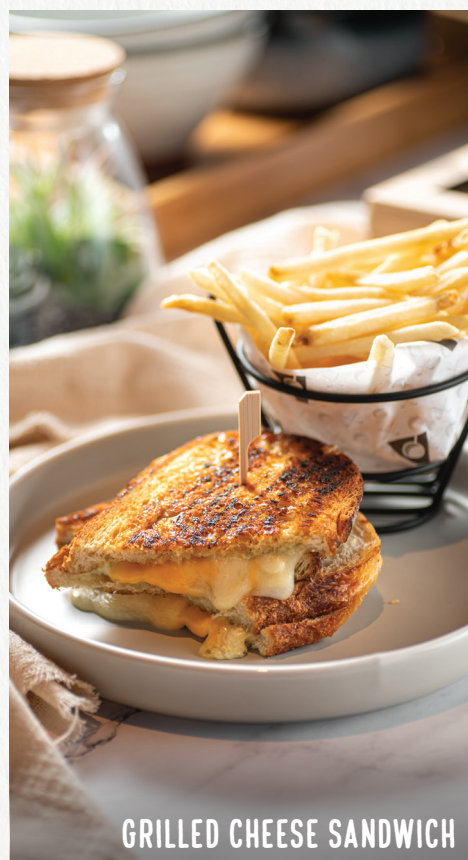
GRILLED CHEESE SANDWICH

housemade corned beef, sourdough, sauerkraut, swiss cheese, russian sauce