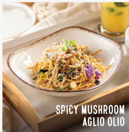
SPICY MUSHROOM AGLIO OLIO

spaghetti tossed with shimeji mushroom, shiitake and king mushroom, garlic, chili flakes, spinach, parmesan cheese.